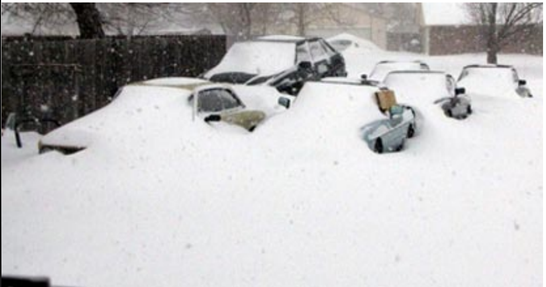
Not ready for Romeo and Giulietta: The Perlingiere Alfas are buried by the 20 inches of snow that fell in Owasso during the Blizzard of 2011.