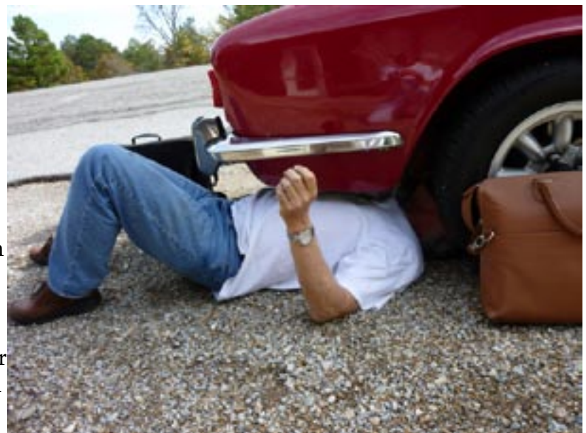
Not the most comfortable place to change a fuel pump, but it worked.